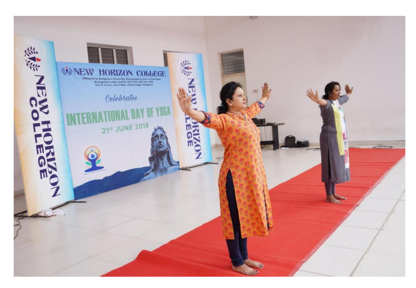
Organised the International Yoga day in our college campus