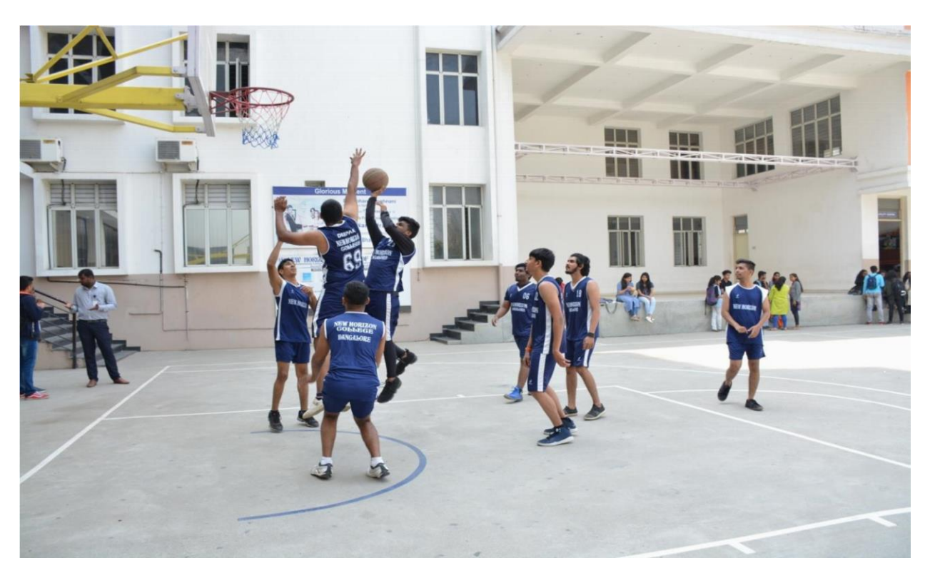
Basket Ball Court