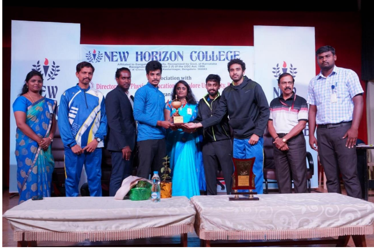
Organized the Bangalore University Inter- Collegiate Table tennis Tournament (Women) on