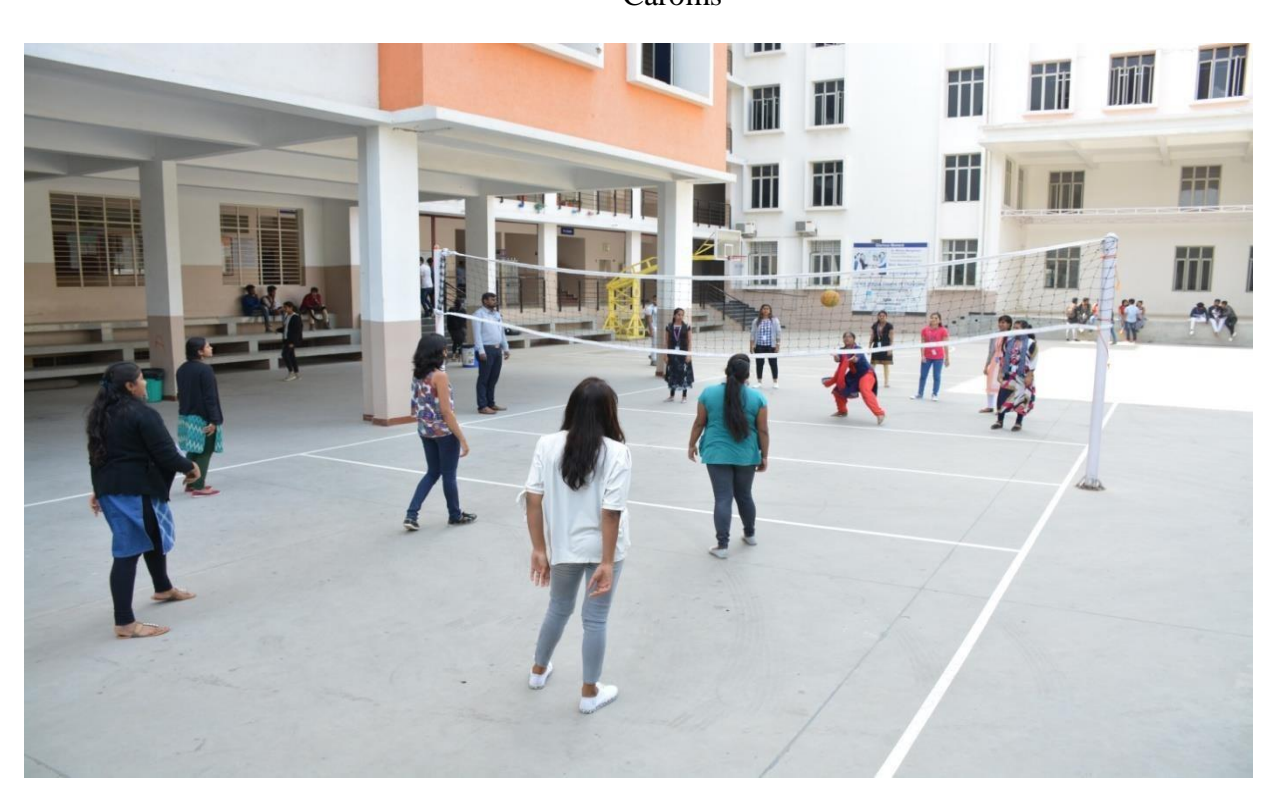
Throw ball court Table tennis boards