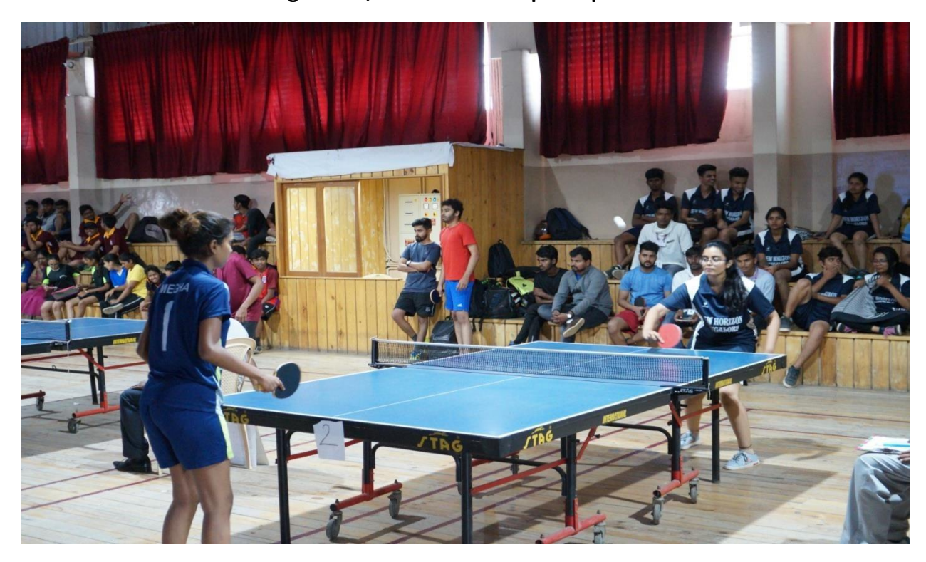
3<sup>rd</sup> and 4th October 2018 Single zone, around 9 teams participated this event