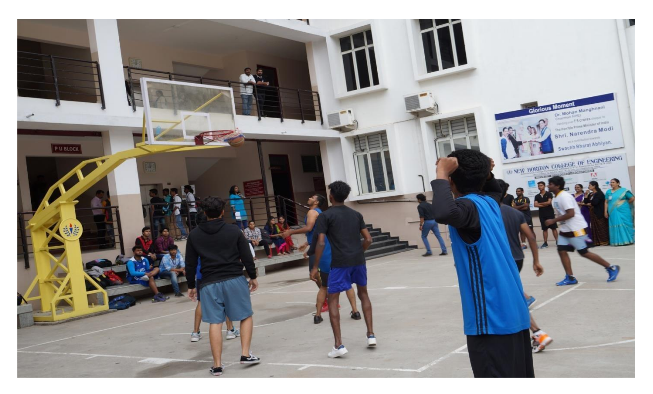
Organised Fresher's day for sports events like Basket ball, Football and Throw ball