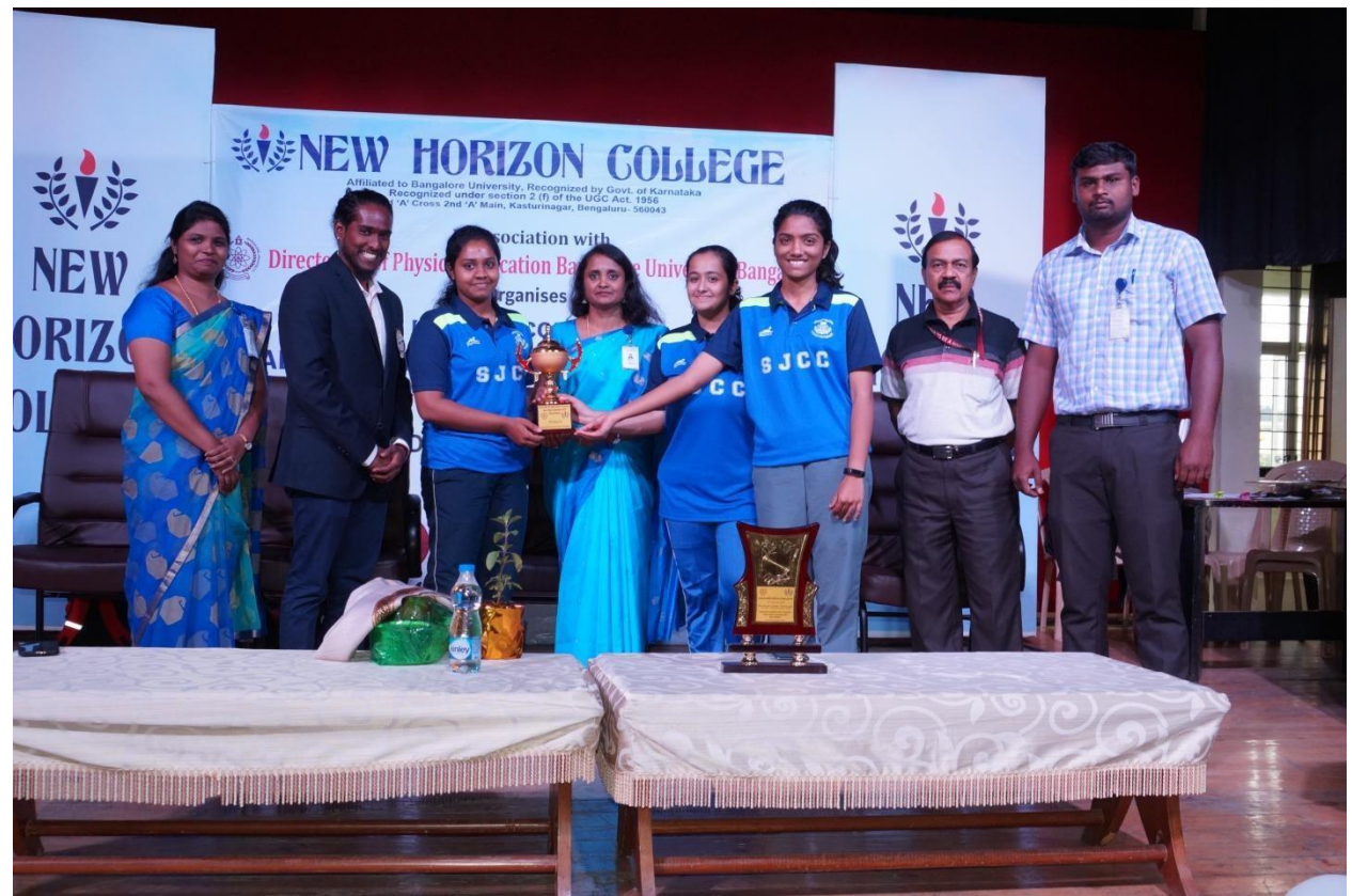
Organized the Bangalore University Table tennis (Men women) selection trails on 5th