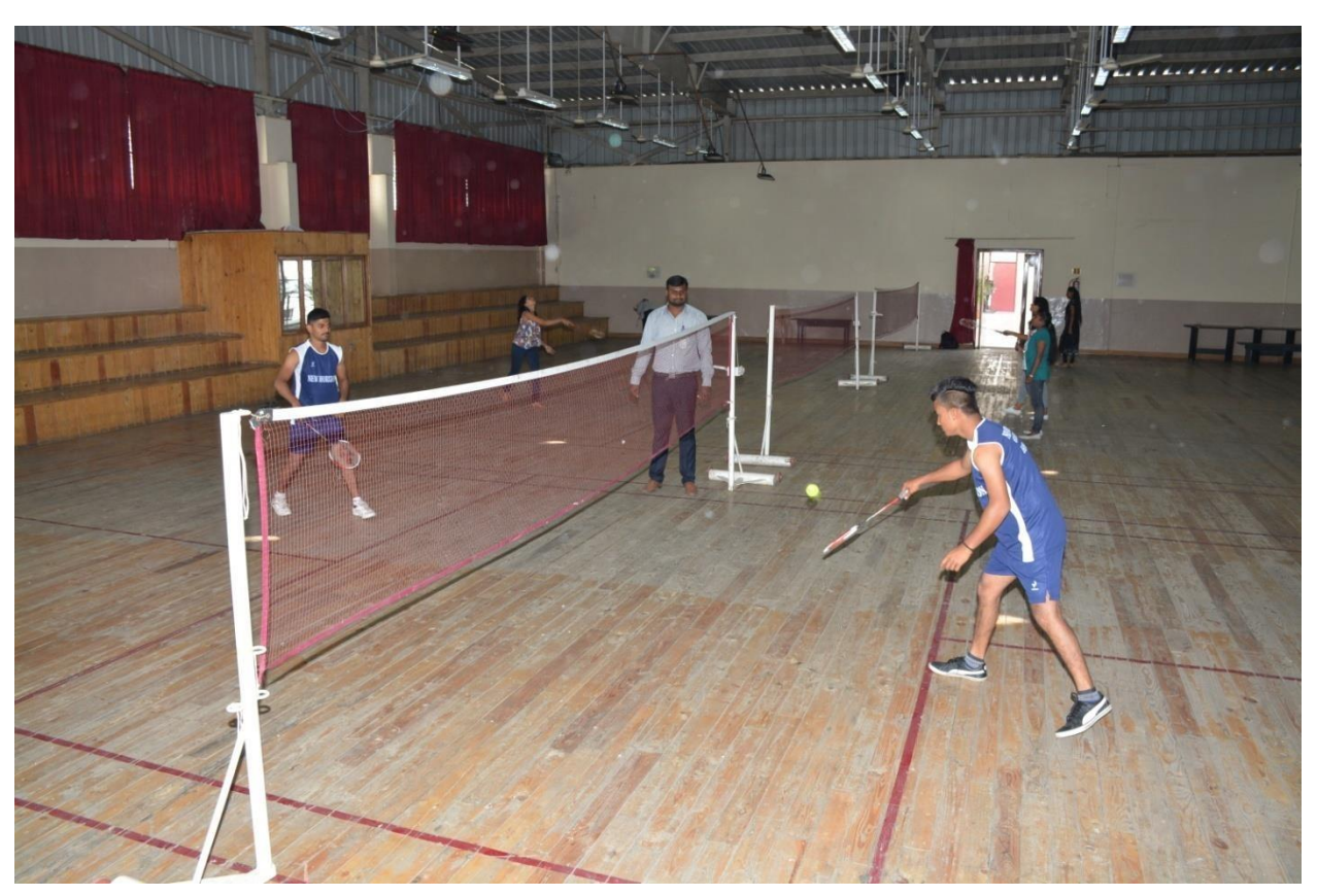
New Horizon College – Kasturinagar