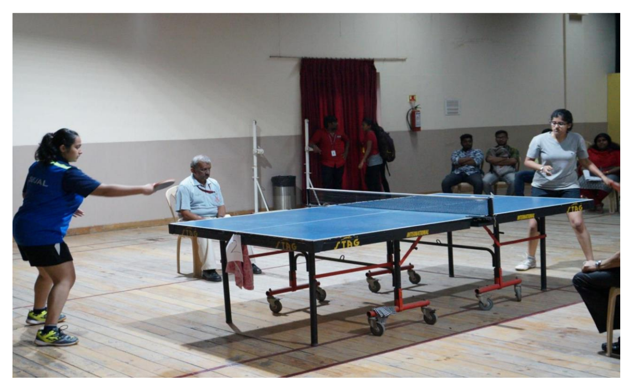
October 2018 many colleges are participated