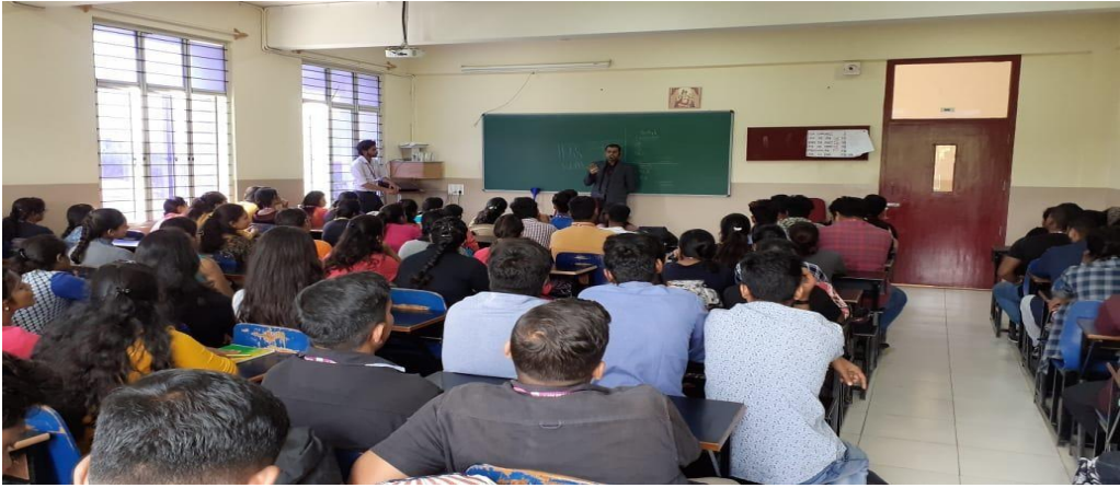
The Speaker addressing the students