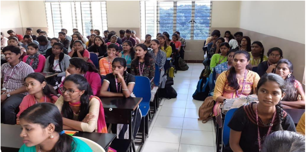
Students engrossed in the session