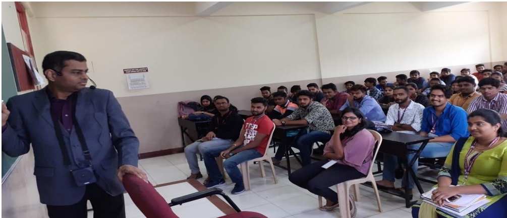
Speaker enlightening the students on Various Career Choice

ACCA provides skills and knowledge about all the areas of business, financial statements, management accounting, business taxation and business ethics. CMA is the highest level of certification in management accounting that acts as a global passport for accountants and finance professionals, awarded by Institute of Management Accountants (IMA, USA).