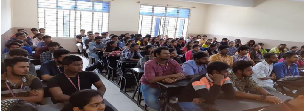
Students engrossed in the session

This Seminar enabled the students to dispel the doubts and qualms regarding their career.