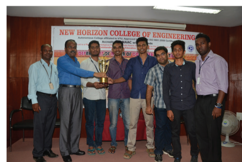
Dept. of MCA: NHCE

The first department Magazine titled "Jnana Vichara" was unveiled in public forum.