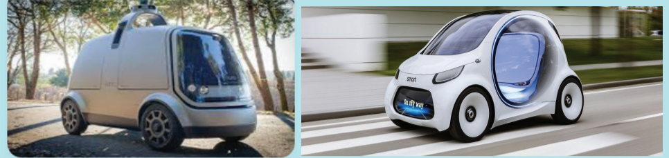
NURO Autonomous Delivery car

An Autonomous Vehicle (self-driving vehicle) is a vehicle that is capable of sensing the environment, processing it and navigating all by itself, without any human input.