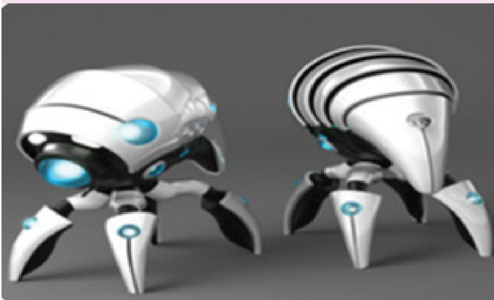
Nano Robots For Military Applications

The immune system is comprised of two important cell types: the B-cell and the T-cell. The B-cell is responsible for the production of antibodies, and the T-cell is responsible for helping them out.