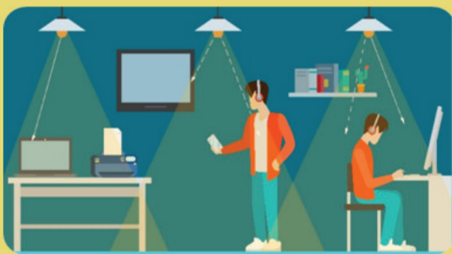
LI-FI: The Future of Internet

Li-Fi is a bidirectional, high-speed and is a fully networked wireless communication technology similar to Wi-Fi. It is a form of visible light communication and a subset of an Optical Wireless Communications (OWC) and could be a complement to RF communication (Wi-Fi or cellular networks), or even a replacement in context of data broadcasting.